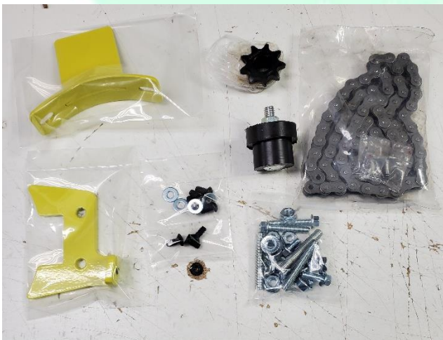
Stop, Base, Sprocket, Tightener, Chain & Hardware Kits

This installation will require Metric and SAE wrenches.